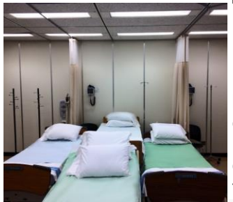
Dumont Technical Institute recently received a donation of beds from the University of Regina Faculty of Nursing For the Continuing Care Assistant program in Meadow Lake